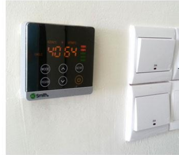
• Control panel outside bath