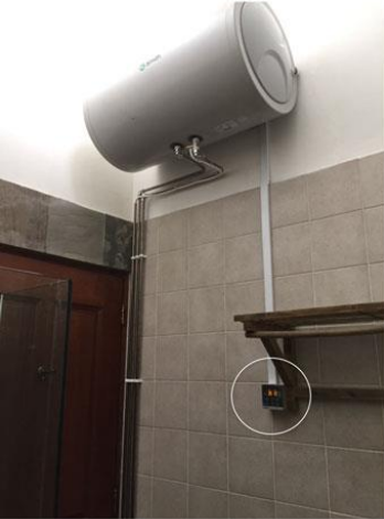
• Control panel inside bath